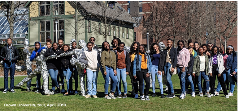
Brown University tour, April 2019.

Due to federal guidelines, household income and parental information is required for the completed application. Eligibility criteria is established by the U.S. Department of Education.